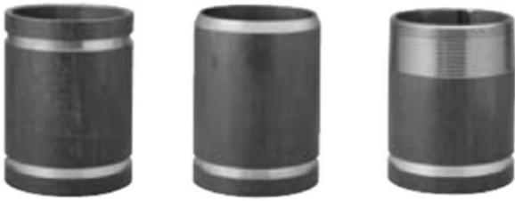
Model #57 Gr.xGr. Model #58 Gr.xBev. Model #59 Gr.xTh.

Shurjoint standard fitting pressure ratings conform to the ratings of Model 7707 couplings.