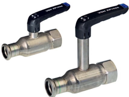
VSH XPress FullFlow Stainless ball valve (press x union nut)