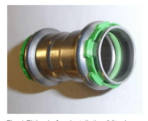
Fig. 1 Fitting before installation (Viton)