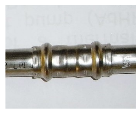
Fig.2 Pressed Fitting